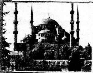
Blue mosque, Istanbul - Turkey.